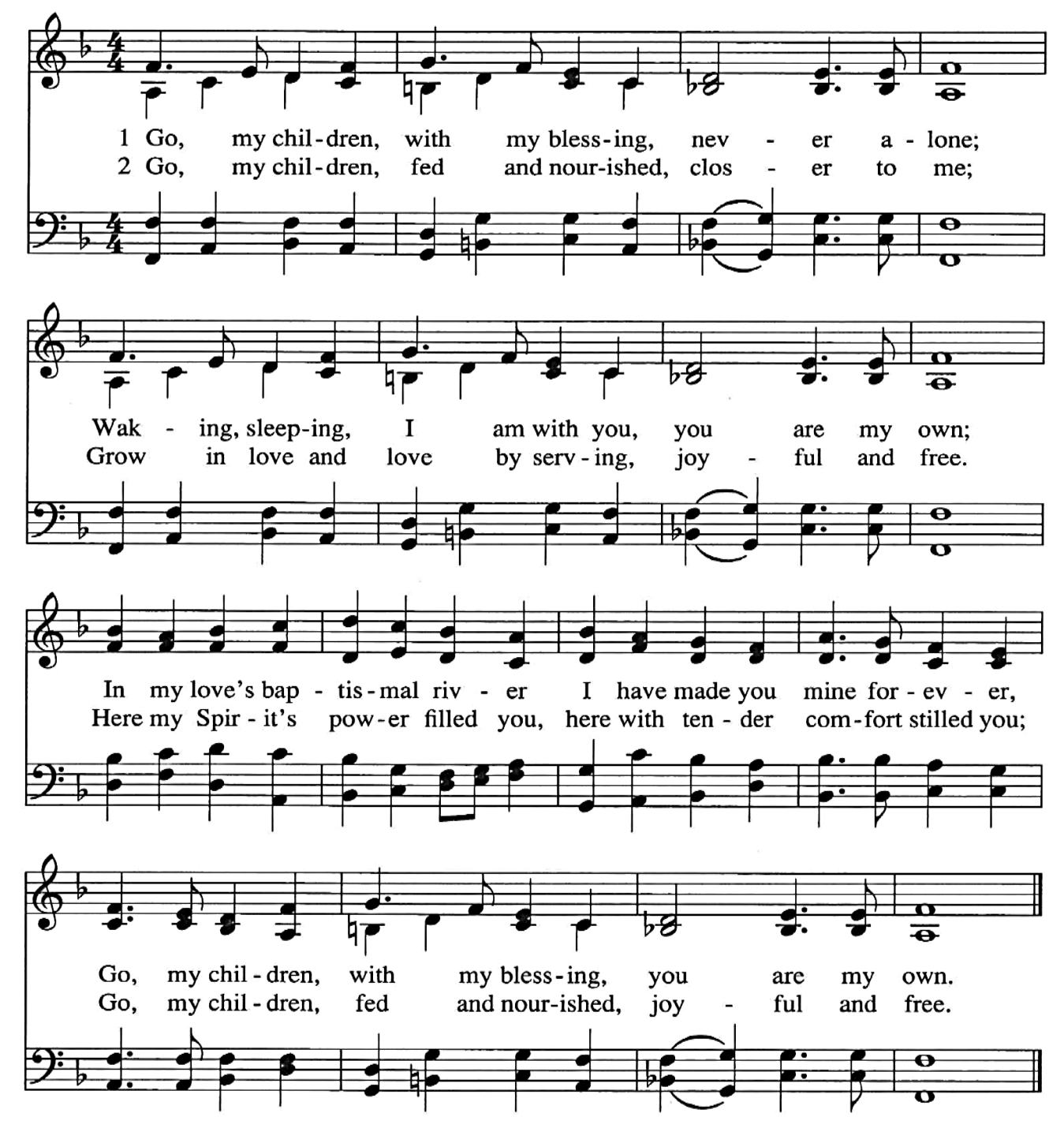
For marriage services, this stanza may be sung between stanzas 1 and 2 above.

In this un-ion I have joined you hus-band and wife, Now, my chil-dren, live to-geth-er as heirs of life: Each the oth-er's glad-ness shar-ing, each the oth-er's bur-dens bear-ing, Now, my chil-dren, live to-geth-er as heirs of life.