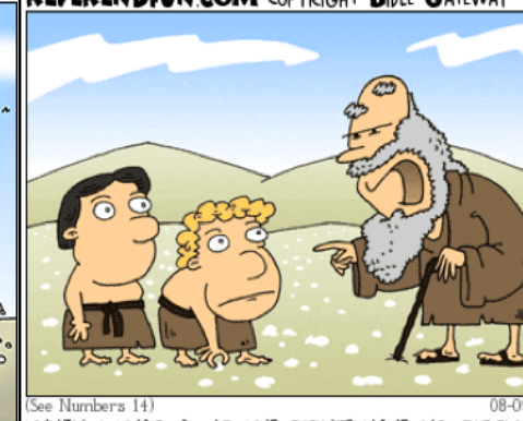
(See Numbers 14) WHEN I WAS A KID WE DIDN'T HAVE NO SISSY MANNA ... WE ATE SAND AND WE LIKED IT